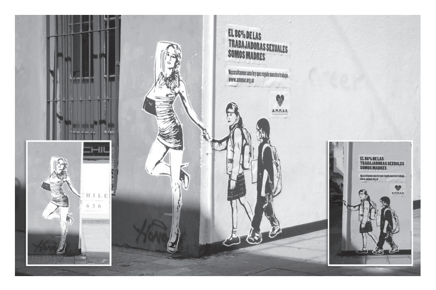
Image 1: An example of AMMAR's campaign. The message on the wall reads: '86% of sex workers are mothers. We need a law that regulates our work.'

At the intersection of popular culture and radical media, and on the heels of La Cebolla , AMMAR has cleverly utilised public spaces to drive home a political message. Borrowing from Banksy's famous street stencils, the organisation started an innovative campaign in 2013, by adorning walls on various street corners in Buenos Aires with mural paintings. Depicting women on one side and their children on the other, the campaign stressed that 86 per cent of Argentine sex workers are mothers, bringing attention to the fact that sex workers are women with familial connections and obligations, and are integrated into communities as mothers and breadwinners.<sup>39</sup> The murals not only facilitated neighbourhood discussions and awareness, but this labour rights campaign also received widespread media attention, even winning an international prize from a public relations and communications magazine.<sup>40</sup>